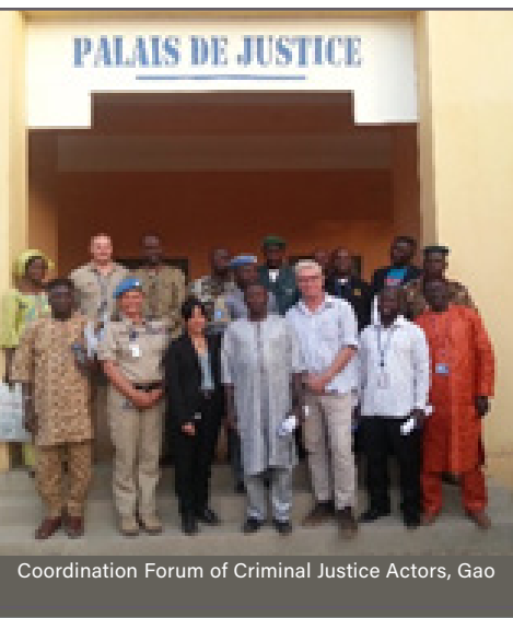
Coordination Forum of Criminal Justice Actors, Gao

authorities) to identify and address blockages in the processing of specific case files as well as to consider more systemic issues and institutional needs.