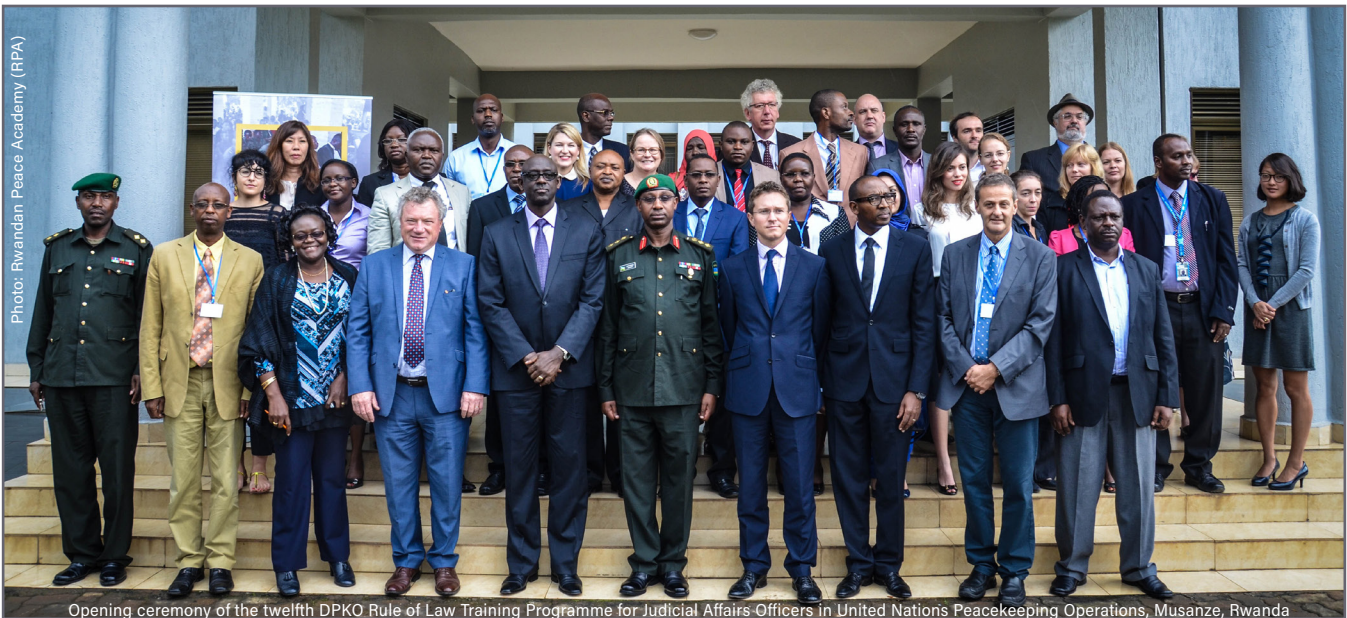
Opening ceremony of the twelfth DPKO Rule of Law Training Programme for Judicial Affairs Officers in United Nations Peacekeeping Operations, Musanze, Rwanda