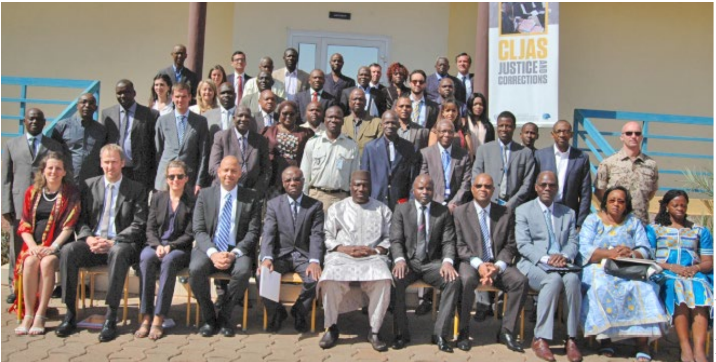
Participants in the DPKO Rule of Law Training Programme for Judicial Affairs Officers in Mali, March 2015.