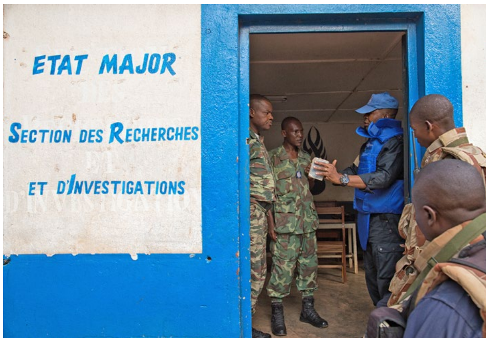
UNPOL Operation in Boyrab.