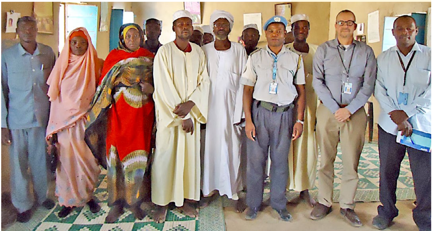
JCSC Team Leader and UNAMID Rule of Law staff meet paralegals in Dorti IDP camp (El Geneina, West Darfur) to discuss rule of law issues.